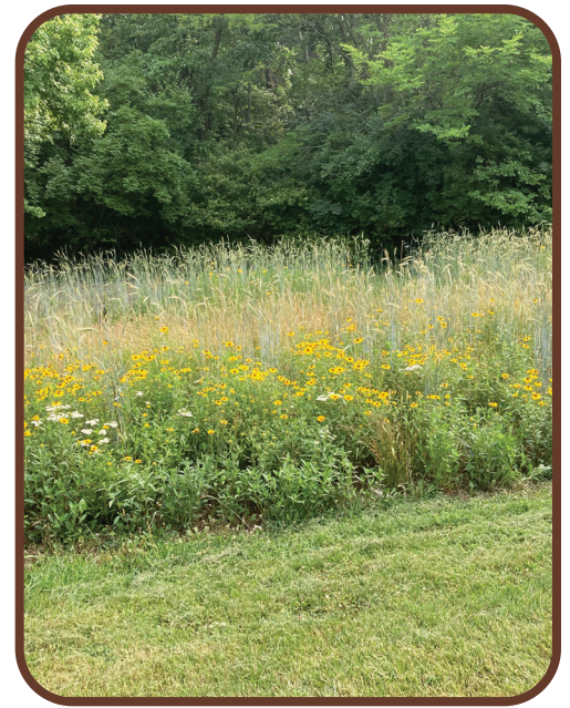
Seeded area filled with black eyed susan at Colonial Park