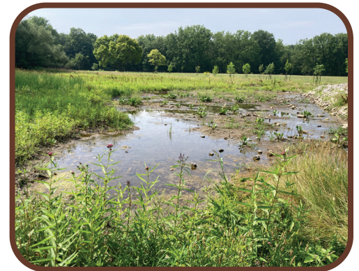
Restored wetland at Venoy Park