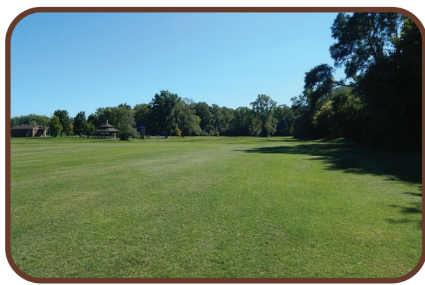
Maintained lawns will be converted to prairie/wet meadows

This project is funded through a grant from the U.S. Environmental Protection Agency Great Lakes Restoration Initiative (grant # GL-00E02830-0)