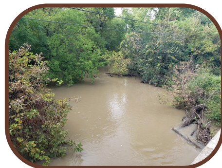
Rouge River after rain event