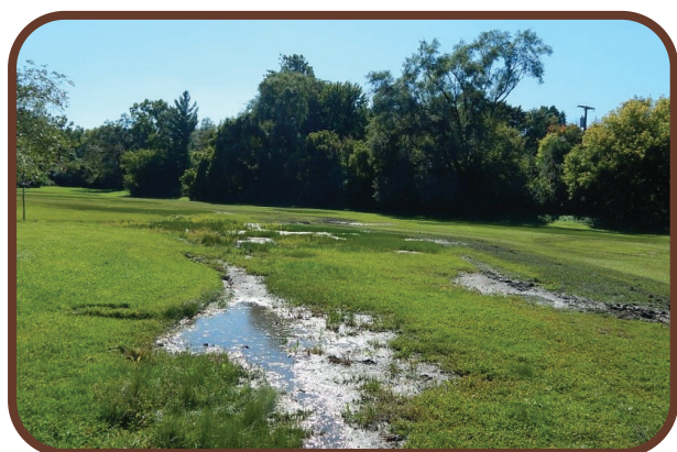
Often flooded areas will be converted to wetlands/wet meadows