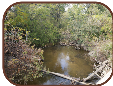
Rouge River prior to rain event

As water quality in the Rouge River continues to improve, this project will build on past efforts to restore some of the damage done during the last century. Tributaries of the Rouge River have suffered from loss and impairment of aquatic habitat and increased frequency and magnitude of flood flows, primarily due to increasing urbanization within the watershed. The flat river slope and the meandering channel can not pass the large flows associated with rain events. Upstream urbanization continues to exacerbate this problem as runoff from increased amounts of impervious surfaces culminates in flooding within the river system, bank erosion, and continued habitat degradation. This project will create habitat in the floodplain by restoring degraded areas and converting mowed areas to habitat. This will provide habitat for birds, amphibians, and pollinators while providing stormwater storage and filtration to aid in the reduction of damaging flood flows within the river itself.